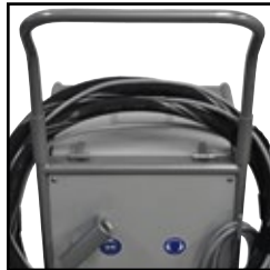
Integrated holding device for hose