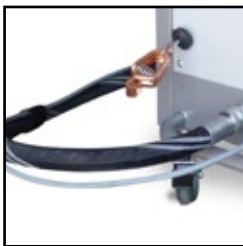
Integrated grounding wire for more safety