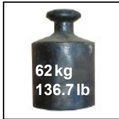
Lightweight and compact