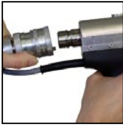
Powerful and handy blasting gun with quick connect coupling