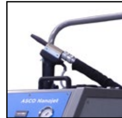
Vertically adjustable handle for easy handling