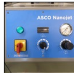
Control panel for easy overview