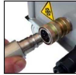
Quick connect coupling at blasting hose