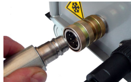
Quick coupling on the blast hose