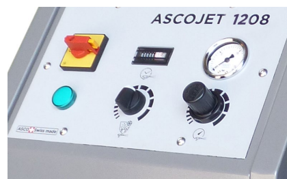
Control panel for easy overview