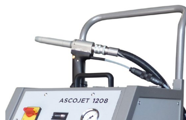
Height-adjustable handle for easy handling