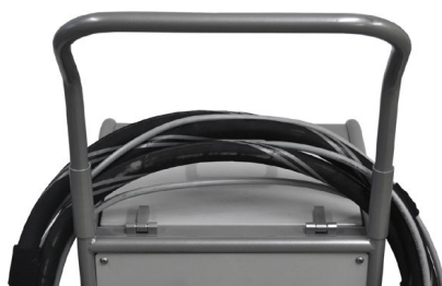
Integrated hose suspension