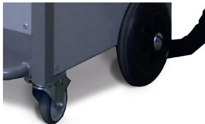
Easy and convenient to maneuver