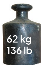
Lightweight and compact