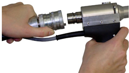
Powerful and handy blast gun with quick coupling