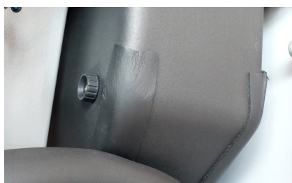
Insulated dry ice container with a capacity of 9 kg