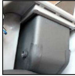
Insulated pellet hopper with 6kg (13.22lb) capacity