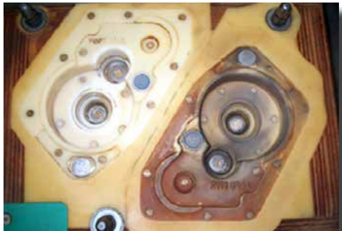
Removal of release agent from a PU core box

With traditional blasting using sand or glass beads, the cleaning process is delayed for as long as possible, which often leads to aluminium residue on the mould's surface. The time required for the removal of the moulds and the subsequent cleaning then amounts to several hours.