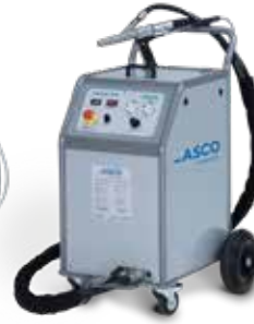
Dry Ice Blasting Unit ASCOJET Combi blaster 1708