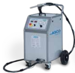
Dry Ice Blasting Unit ASCOJET 1701