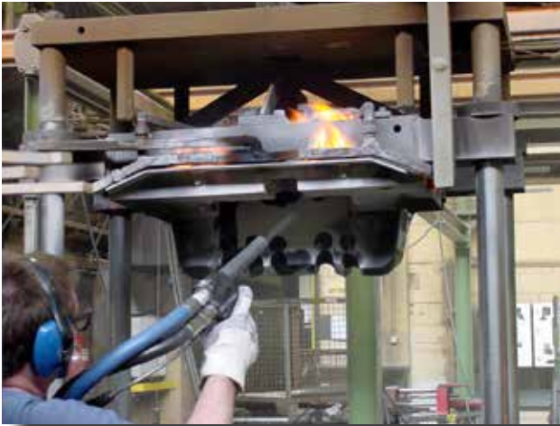
Online cleaning of a hot ingot mould