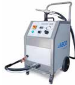
Dry Ice Blasting Unit ASCOJET 1208