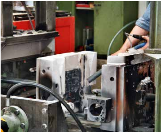
With the ASCO dry ice blasting technology production downtimes are avoided.