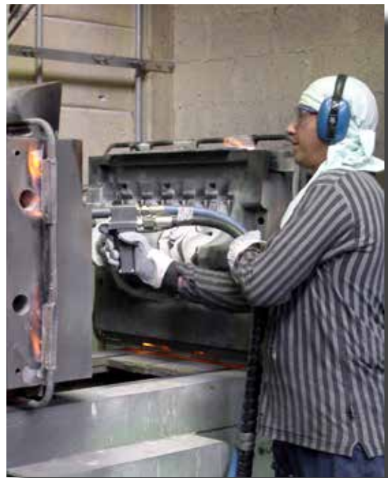
Cleaning of built-in hot moulds