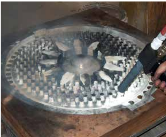
Cleaning of a core box in the automotive industry

The ASCO dry ice blasting system offers the usual option of cleaning dismantled moulds in cabins or to perform the cleaning operation directly on the mounted hot moulds. Many gravity die casting foundries use the second option to avoid expensive production stops, and to attain higher quality thanks to more frequent cleaning. The moulds are not damaged, because the blasting material is virtually non-abrasive.