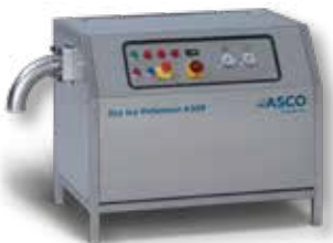
Dry Ice Pelletizer A55P

Our product range contains dry ice pelletizers with production capacities from 30 to 700 kg/hr.