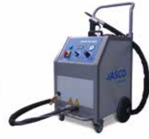
Dry Ice Blasting Unit ASCO Nanojet