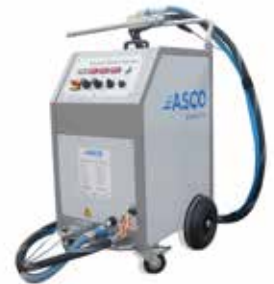
Dry Ice Blasting Unit ASCOJET 2008 Combi Pro blaster 1708

ASCO not only introduces you to the ASCO dry ice blasting technology but also helps with integrating dry ice cleaning into the production process and continually optimizing it.