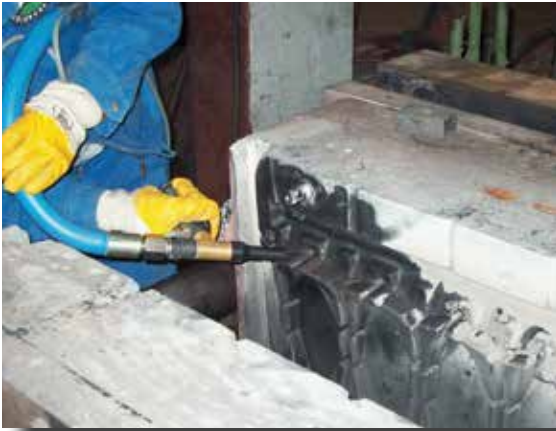
Online cleaning of a hot ingot mould