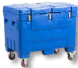
Dry Ice Container AT240

Production capacity 55 kg/hr for 3 mm pellets