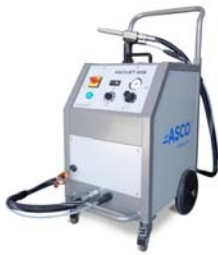
Picture 2 – The new ASCOJET 608 has an integrated pellet grinder which crushes the dry ice into finest particles – for an even more gentle cleaning of molds and surfaces.